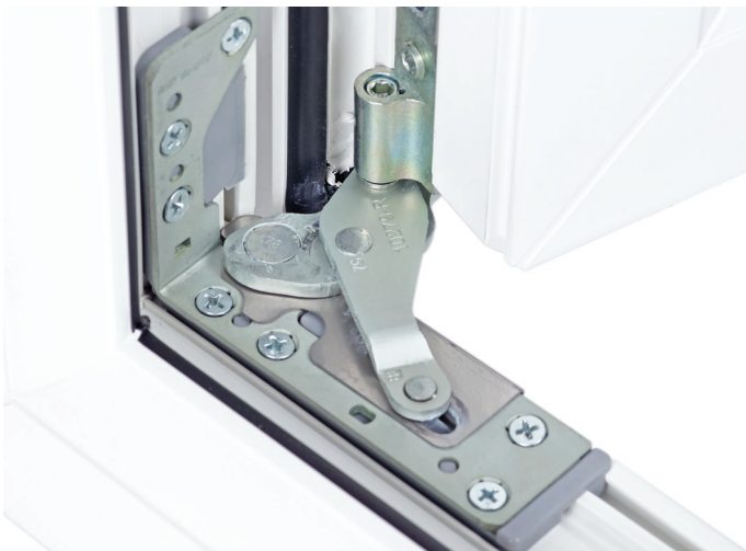
Easy to assemble corner hinges and adjustment point