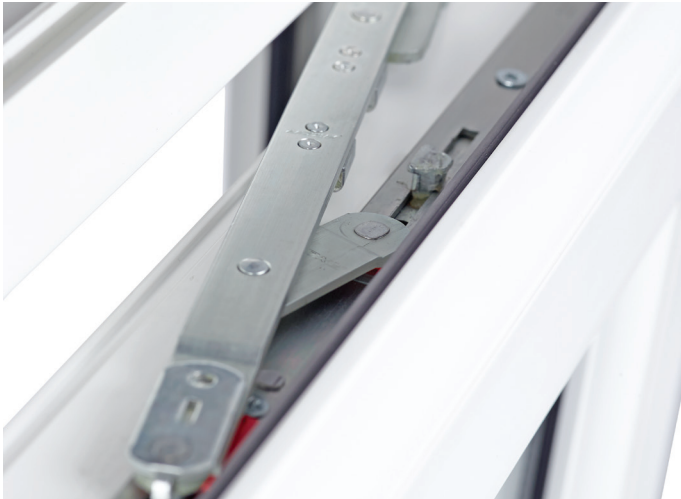
Concealed hinges for improved sight-lines